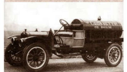
The first tanker truck was invented in 1905 by a company called Anglo-American, a subsidiary of Standard Oil