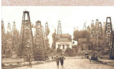
In 1911 Standard Oil's vice like grip on the American petroleum industry was broken when the Supreme Court ordered the company to be broken up into 34 companies.