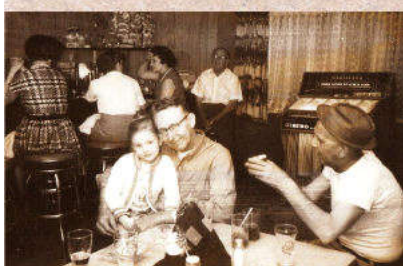
A 1950's era Wurlitzer employs patrons to "enjoy little LP album music"