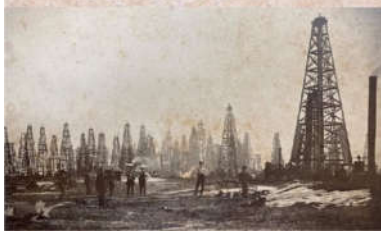
The earliest known oil wells were drilled in China around 347 AD. Drilled with bits attached to bamboo poles, these wells reached depths of over 800 feet