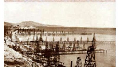
The first offshore oil platforms were built on piers attached to land in 1897. Within 5 years there were over 400 pier wells on the California coastline