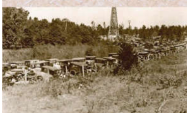
In 1863 John D Rockefeller formed Standard Oil. Later, through eliminating competition, Standard Oil would come to control nearly all oil production in the US