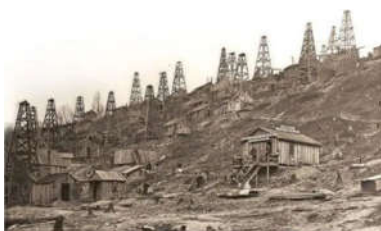
Oil was first used more than 4000 years ago and was employed to build the towers and walls of Babylon