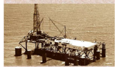
The first mobile offshore drilling rig was built in 1954 and named Mr. Charlie. That same year George Bush signed a contract for the first jack up oil rig. George became the President of the United States 45 years later.