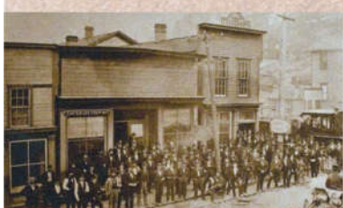
In 1816 Rembrandt Peale made headlines when he illuminated a room at his museum with gas lamps. By 1817 his company installed the first gas street lamp in the United States in Baltimore