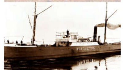
The first tanker ship was built in 1878 by the Nobel Brothers in Baku Azerbaijan. Unlike previous ships that moved oil in barrels, the Zoroaster was designed with built in tanks