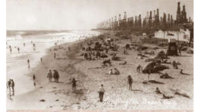
The first Californian well was drilled in 1865. By the 1930's the beaches were dominated by oil fields.