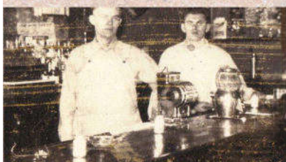
April 18th, 1948