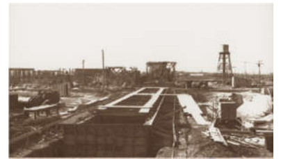
In 1917, Shell Oil built the Wood River Refinery. It is capable of refining over 200,000 barrels of crude oil per day

Upgrade your Wrap from Chicken to Skirt Steak for only three dollars